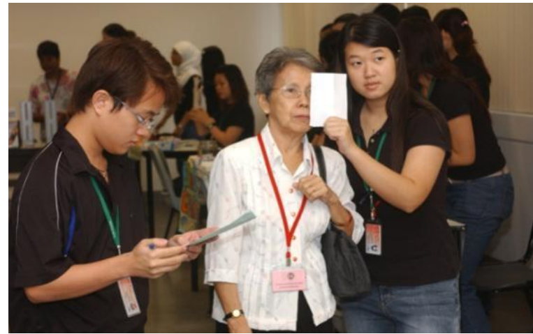
Health Education and Community Health Fairs